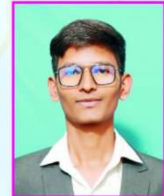
Shrigiri Hipparagi Artistic Yogasana