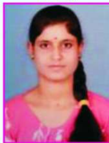
Amrutha Halli Hockey