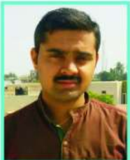
Sampat Kalakeri Corporation Bank